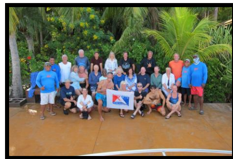
Enjoy a Beautiful Resort