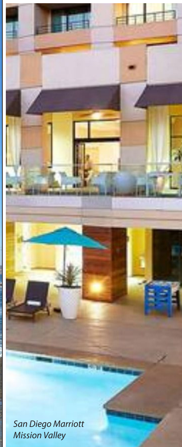
San Diego Marriott Mission Valley