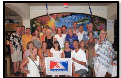
Enjoy a Beautiful Resort