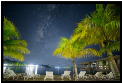
Experience Honduran Culture & Entertainment