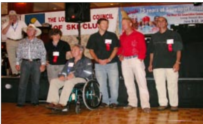
Friday Night Silent Auction