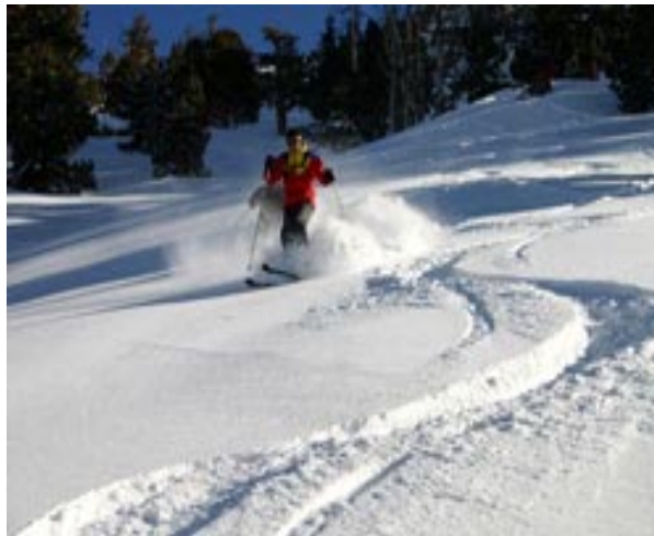
Skiing at Kirkwood

racers with monetary assistance, while they are young and on their way up through the ranks of regional and national sanctioned races. If you are interested in this program for your kids or friends, information about this program is on the FWSA website. The Far West Ski Association is accepting monetary donations for this scholarship program and hopes to continue to expand this program in future years.