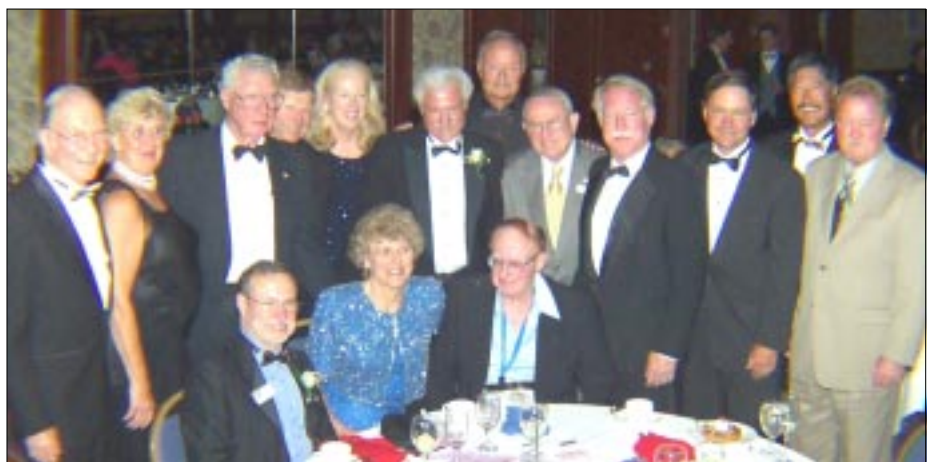
Hans Georg Awardees