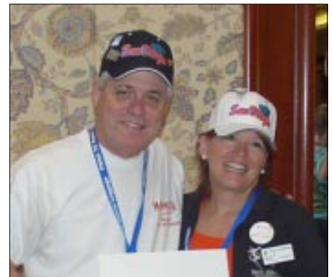
Club Outstanding Newsletter AAAA First