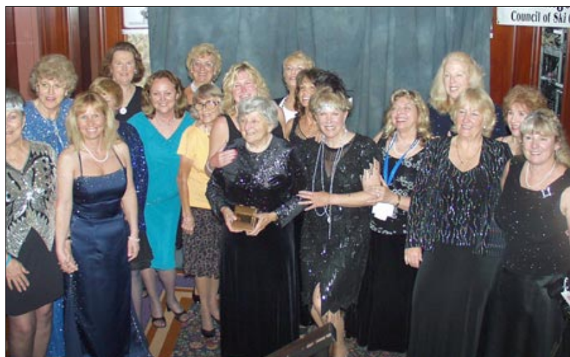
Elizabeth "Schatzi" Wood Awardees