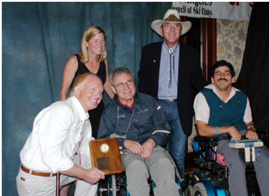
Jimmie Heuga Awardees

A great big THANK YOU to all the participants for helping to make our forum such an informative and fun experience.