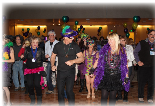
Marti Gras Farewell Party