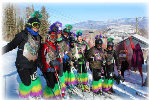
Left: Racers lined up getting ready to head down the course