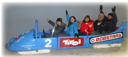
Photos from International Ski Week