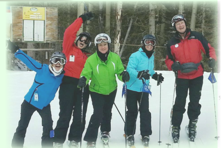
Phoenix Ski Club - Taos Trip