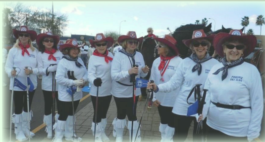
Phoenix Ski Club 65th anniversary Parada Del Sol Drill Team