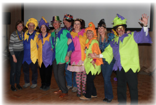
Council Challenge Team who won the best costume award

The clubs are busy with ski trips this time of year. We have several clubs going to Mammoth Mountain Ski Area for weekend and mid-week trips. NIS and Torrey Pines Ski Club are going to Whitefish Mountain Resort , Qualcomm Ski Club is going to Park City , Pacific Rim is going to Big White Ski Resort , and Action Ski & Snowboard Club is going to Steamboat Ski Resort . Qualcomm Ski Club is also running a family-oriented Learn to Ski Day at Big Bear Mountain Ski Resort this year. They have two days scheduled with 3 buses each day. That is potentially 300 new skiers. Hurray!