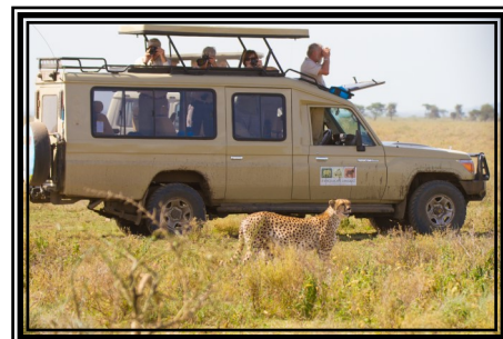
Safari Cruiser with Cheetah