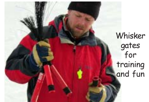
Whisker gates for training and fun