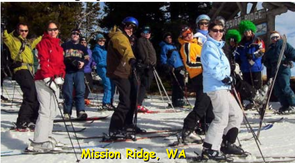
Mission Ridge, WA