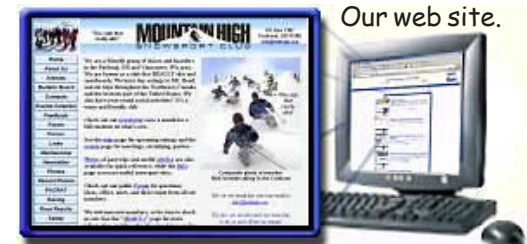
Our web site.