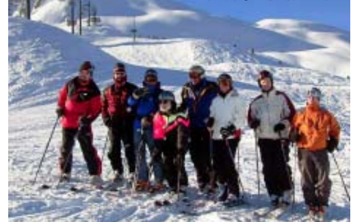
Mt. High members at Mt. Baker, WA.