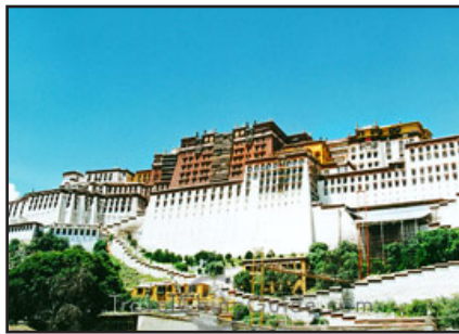
Built by King Songtsen Gampo in the 7th century, Potala Palace

After breakfast, depart Beijing by deluxe motor coach to explore the Great Wall, one of the seven world wonders.