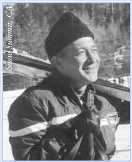
Snow Summit, CA