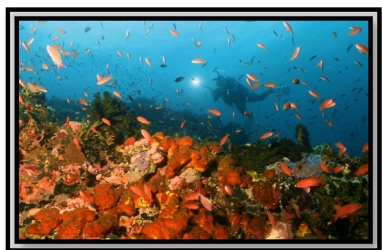
Enjoy the beautiful wildlife!

Transfer from Batangas & to Manila Airport