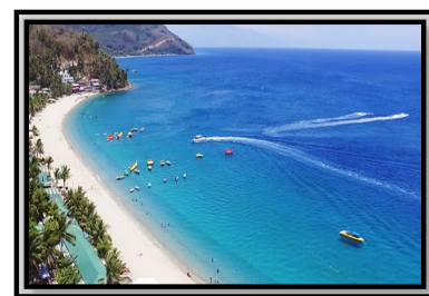
Enjoy the scenic coast!